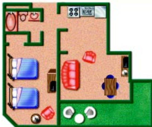
Style C - Oceanview Deluxe Oceanview Suite 2 double beds, 1 wall bed 2 TVs, kitchen, microwave