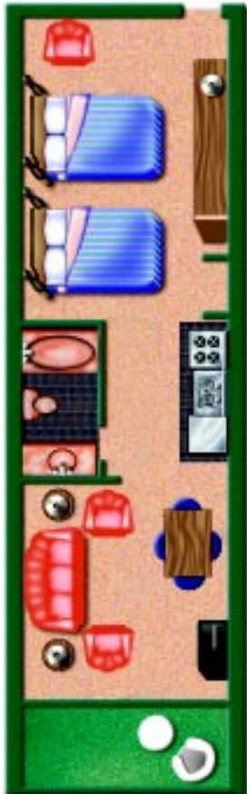
Style A Oceanfront 2-room Suite 2 double beds, 1 wall bed, sleeper sofa, 2 TVs, kitchen, microwave